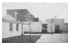
Hawkesley Anglican / Methodist

1st & 3rd Sundays: Holy Communion 2nd/4th/5th Sundays: Morning Worship For All