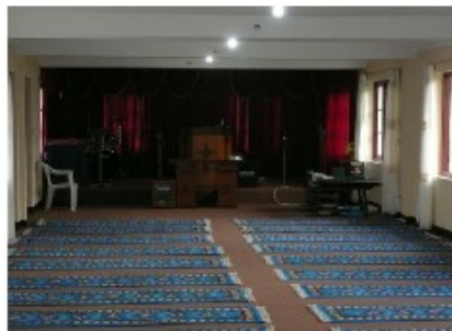
The room used for church services

Lectures now run here and the building is used for both the adult service and children's group on a Saturday morning.