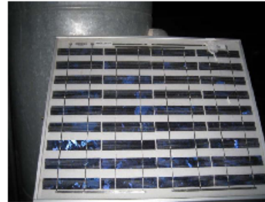
The solar panel

Some of you may remember the article I wrote for a previous edition of the magazine, about raising money for a solar panel to be fitted to one of the orphanages in Kathmandu, to overcome the problems with a shortage of electricity in the country. The family pass on their sincere thanks to all those who kindly made contributions, which helped to make this happen. I was sent a couple of photographs as evidence of the benefits that are now being felt.