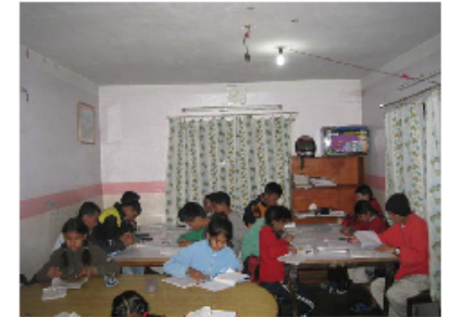
Children studying under its light