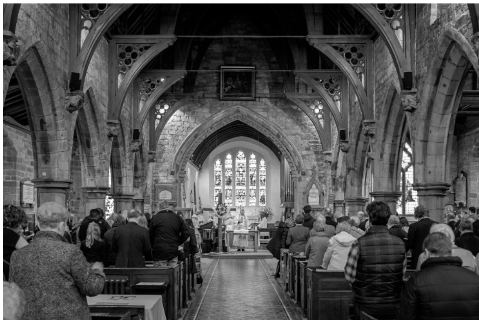
Easter Sunday morning at Saint Nicolas' Church (1 st April 2018). The main 10.30 am service was attended by almost 250 people, of whom 43 were children.