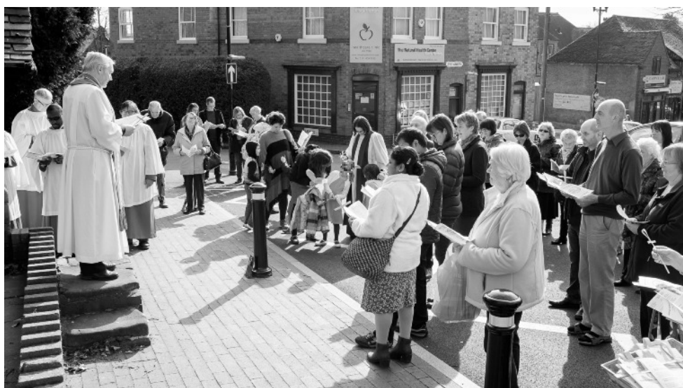
As local tradition requires, the morning service at Saint Nicolas’ Church on Palm Sunday morning (25 th March 2018) began at the Lych Gate on The Green.